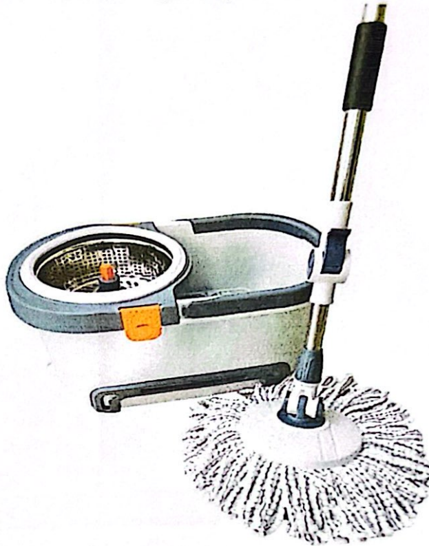
Microfiber Spin Mop and Bucket

Disclaimer: These photos are for reference only